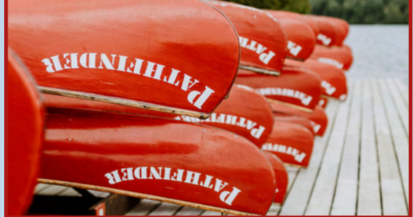
2019 GLM Racers before they head out around the horn