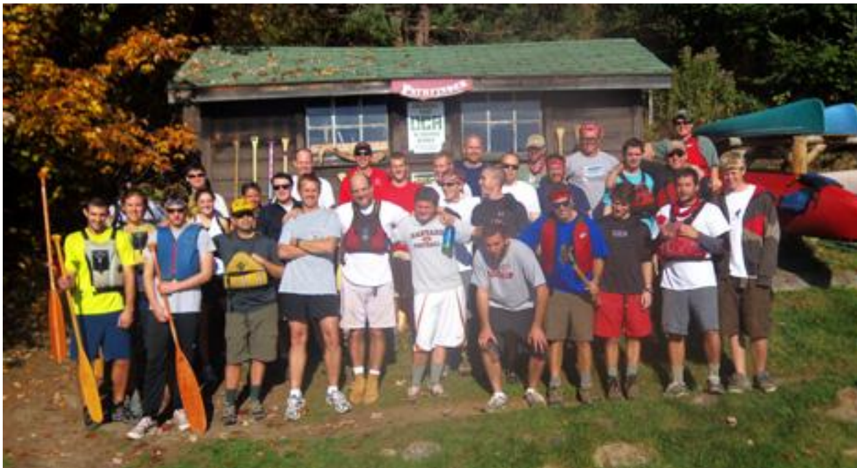
GLM Racers 2011.