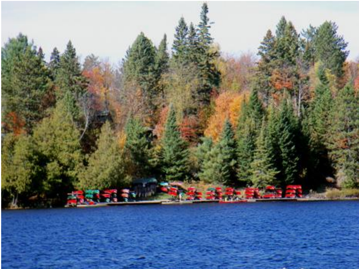
The Canoe Dock at Canadian Thanksgiving.

You can contact me at jcoakley@comcast.net . with any news for the next newsletter.