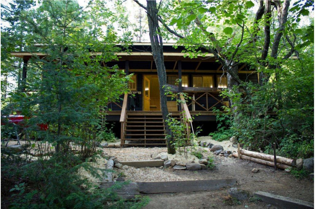
New Canoe Shop

The Canoe Shop: As reported earlier, the Canoe Shop was under construction early in the summer. Warren McDermott gives us an update. “The building construction was completed before the camp season began. Electricity and power tools arrived during August. We are now able to replace broken keels, seats, and thwarts as the canoes return from trips. Wood canvas canoes that need more extensive repairs and recanvassing are also able to be repaired. We have taught campers and staff how to patch a canoe. Campers were able to participate in an optional activity period occasionally during the second half. A number of staff learned the art of caning and repaired over a dozen canoe seats. Also, we will be starting furniture for the staff cabins as needed. Warren is looking forward to doing some boat restorations this fall.”